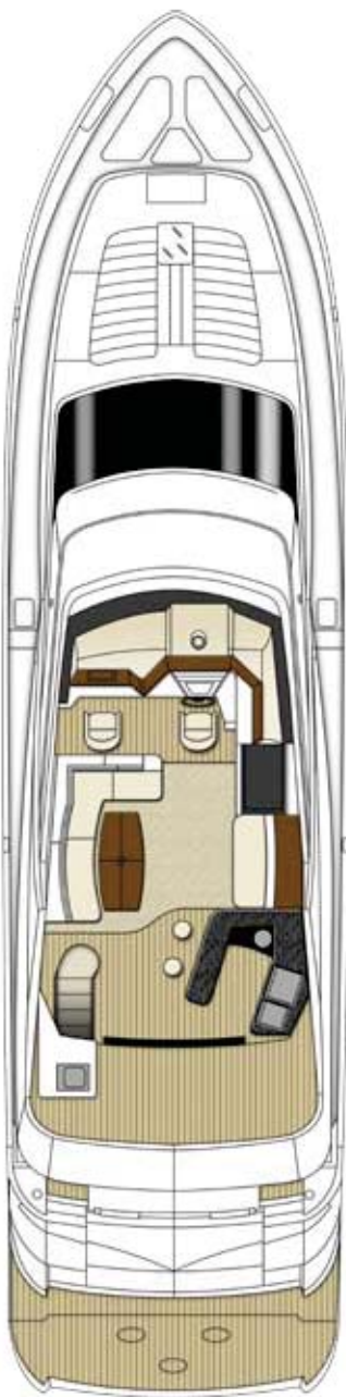
– Tri-Deck –