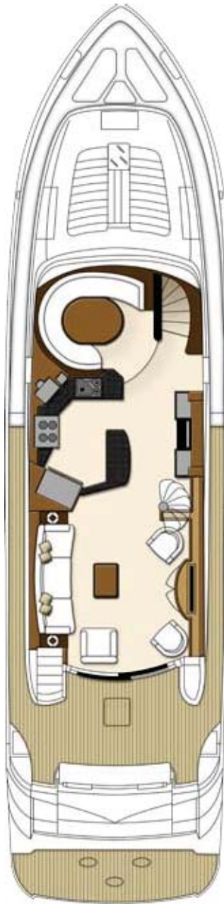
– Main Deck –